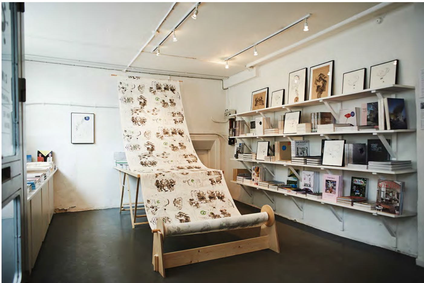
Yuji Mizuta, 'Portrait-Multiverse-Synchronicity', installation view