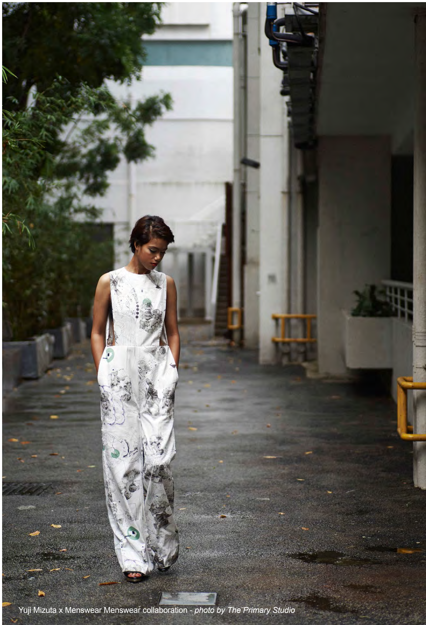
Yuji Mizuta x Menswear Menswear collaboration - photo by The Primary Studio