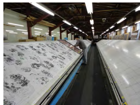
Yuji Mizuta, 'Portrait-Multiverse-Synchronicity', printing process