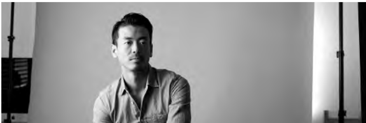
Yuji Mizuta - image courtesy of Yuji Mizuta