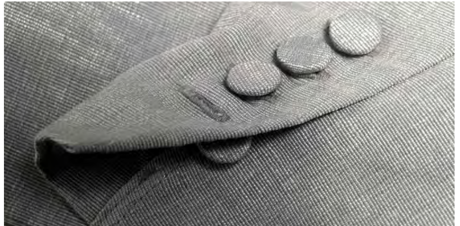
MENSWEAR MENSWEAR Sport Coat 1, S/S 2014 - images courtesy of Zin Cattell