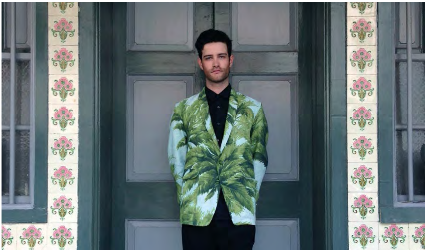
MENSWEAR MENSWEAR Sport Coat 1, S/S 2014 - image courtesy of Zin Cattell

MENSWEAR MENSWEAR is a social and eco-conscious menswear fashion label based in Singapore, founded by designer Zin Cattell. MENSWEAR MENSWEAR is known for its take on the modern unstructured jacket that lends the wearer a sense of sartorial ease.